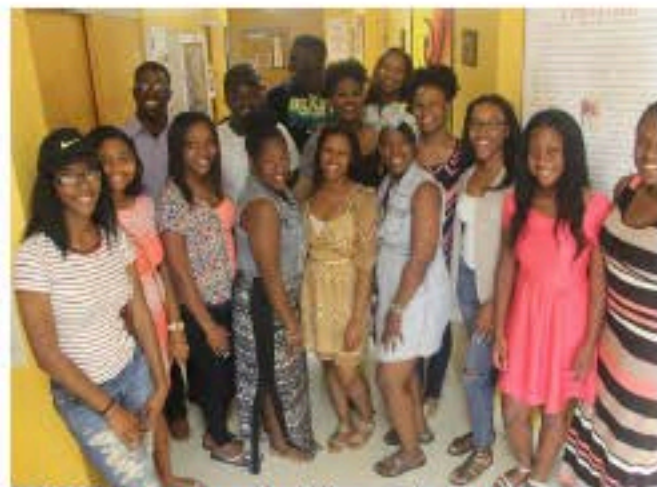
Club Esteem alumni visit over the summer