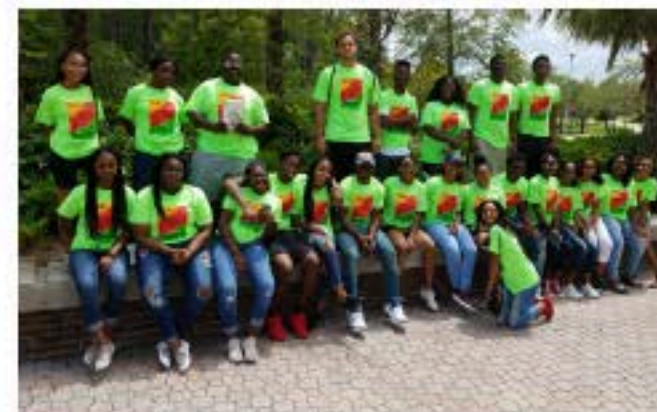
Club Esteem students pose for a group photo during a college visit at UCF.