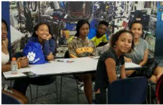
CE students enjoy a visit to Kennedy Space Center during the summer.